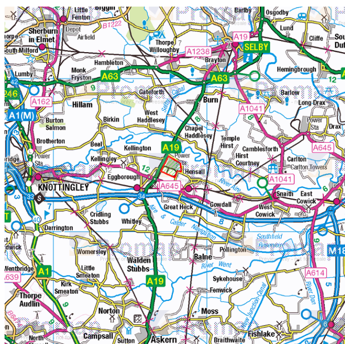
Figure 1.1: Site Location